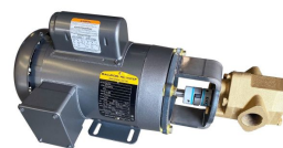
480V Oil Pump at