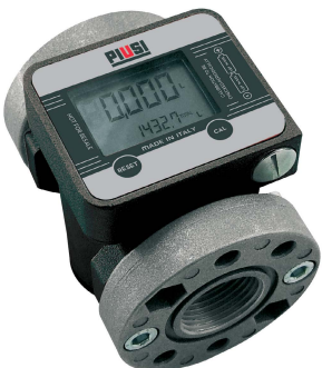
39 GPM Digital Oil