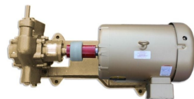
In Line Suction