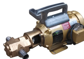
50Hz Portable Oil