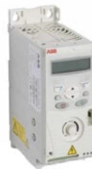
1.5HP ABB ACS 150