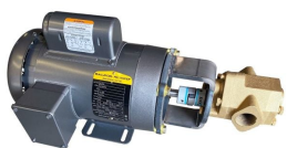
480V Oil Pump at