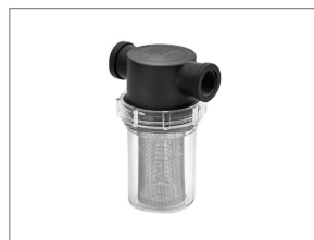
480V Oil Pump at