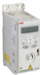
1.5HP ABB ACS 150