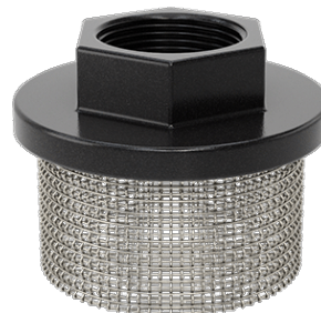
Suction Strainer for