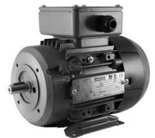
3 Phase Gear Pump