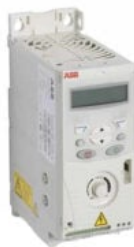
1.5HP ABB ACS 150