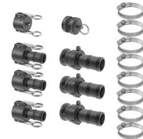
Oil Pump Hose Kit - 1.25 Inch