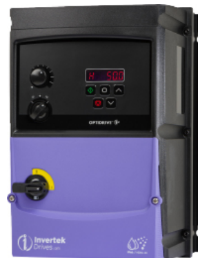
7.5HP VFD for 60GPM Pump Outdoor