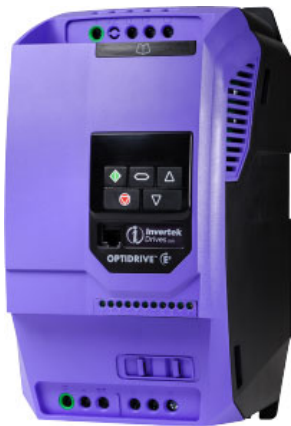
7.5HP VFD for 60GPM Pump Indoor