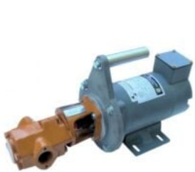
24GPM 12V Oil Transfer Pump