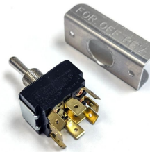
Portable Oil Transfer Pump Reversible Switch