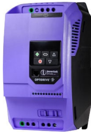
7.5HP VFD for 60GPM Pump Indoor