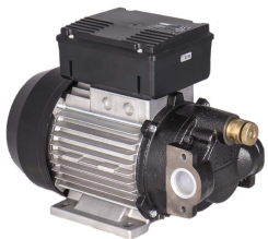
2.4 GPM Viscomat Gear Oil Transfer Pump