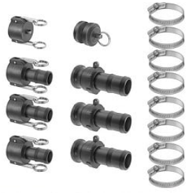
Stainless Steel 25GPM Oil Transfer Pump