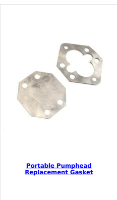
Portable Pumphead Replacement Gasket