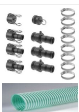
Oil Pump Hose Kit - 1.25 Inch

Since 2009, we have been supplying portable and stationary pumps for moving all types of oil. Oil cleaning centrifuges are also important tools to re-use oil as fuel or lubricant.