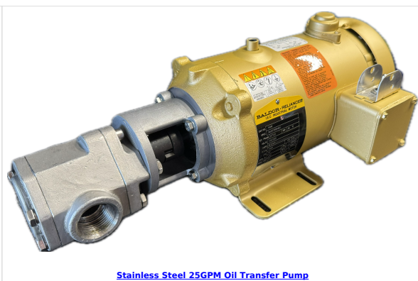
Stainless Steel 25GPM Oil Transfer Pump