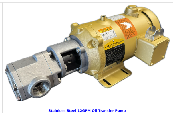
Stainless Steel 12GPM Oil Transfer Pump