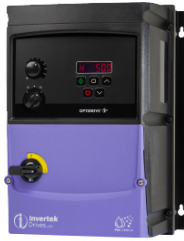
7.5HP VFD for 60GPM Pump Outdoor