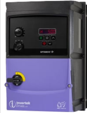
7.5HP VFD for 60GPM Pump Outdoor