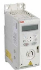
1.5HP ABB ACS 150