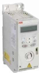
1.5HP ABB ACS 150