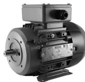
480V Oil Pump at