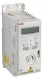
1.5HP ABB ACS 150