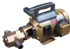
480V Oil Pump at