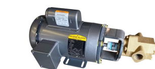
480V Oil Pump at