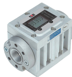
39 GPM Digital Oil