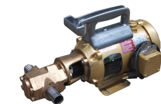
50Hz Portable Oil