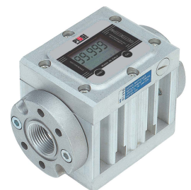
39 GPM Digital Oil