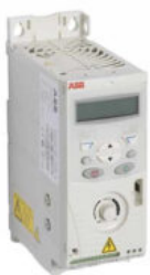
1.5HP ABB ACS 150