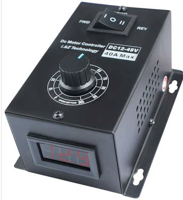
12-48v Variable Speed Controller

Since 2009, we have been supplying portable and stationary pumps for moving all types of oil. Oil cleaning centrifuges are also important tools to re-use oil as fuel or lubricant.