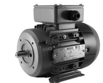
3 Phase Gear Pump