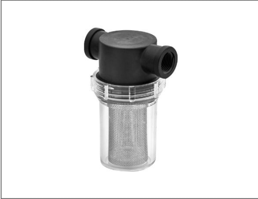
In Line Suction Strainer 1"