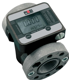
480V Oil Pump at