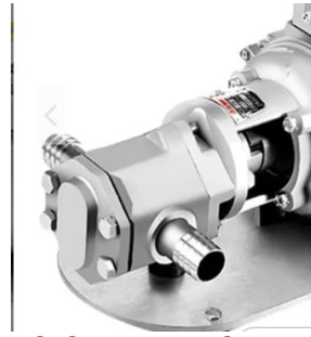
Stainless Steel 12GPM Oil Transfer Pump Head