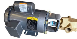
480V Oil Pump at 7GPM