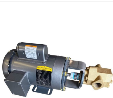
480V Oil Pump at 7GPM