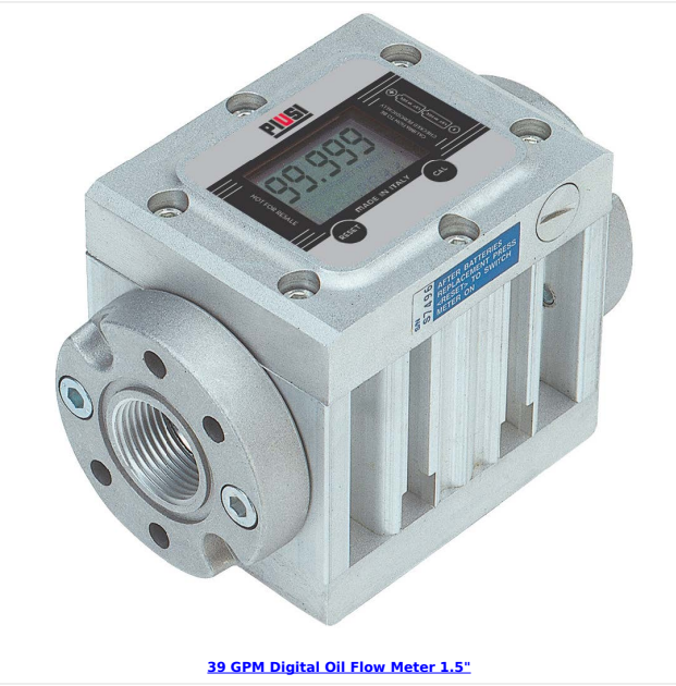
39 GPM Digital Oil Flow Meter 1.5"

Since 2009, we have been supplying portable and stationary pumps for moving all types of oil. Oil cleaning centrifuges are also important tools to re-use oil as fuel or lubricant.