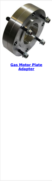
Gas Motor Plate Adapter