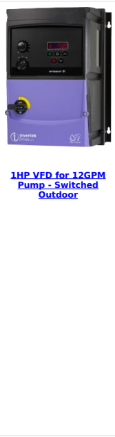
1HP VFD for 12GPM Pump - Switched Outdoor