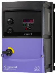
2HP VFD for Pump - Switched Outdoor

Since 2009, we have been supplying portable and stationary pumps for moving all types of oil. Oil cleaning centrifuges are also important tools to re-use oil as fuel or lubricant.