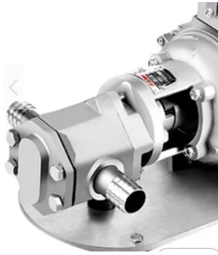
Stainless Steel 12GPM Oil Transfer Pump Head