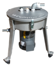
Basic Oil Centrifuge