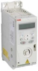
1.5HP ABB ACS 150 VFD