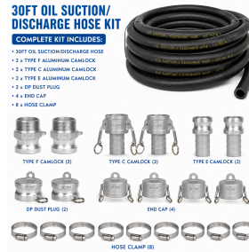
30ft Aluminum Camlock Hose Kit