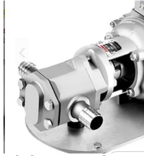
Stainless Steel 12GPM Oil Transfer Pump Head