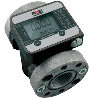
15 GPM Digital Oil Pump Flow Meter 1"

Since 2009, we have been supplying portable and stationary pumps for moving all types of oil. Oil cleaning centrifuges are also important tools to re-use oil as fuel or lubricant.