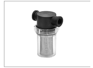
In Line Suction Strainer 1"

Since 2009, we have been supplying portable and stationary pumps for moving all types of oil. Oil cleaning centrifuges are also important tools to re-use oil as fuel or lubricant.