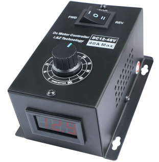
12-48v Variable Speed Controller

Since 2009, we have been supplying portable and stationary pumps for moving all types of oil. Oil cleaning centrifuges are also important tools to re-use oil as fuel or lubricant.