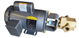
480V Oil Pump at 7GPM

Since 2009, we have been supplying portable and stationary pumps for moving all types of oil. Oil cleaning centrifuges are also important tools to re-use oil as fuel or lubricant.