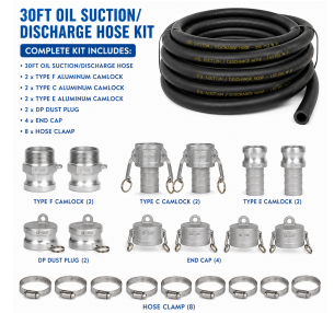
30ft Aluminum Camlock Hose Kit

Since 2009, we have been supplying portable and stationary pumps for moving all types of oil. Oil cleaning centrifuges are also important tools to re-use oil as fuel or lubricant.