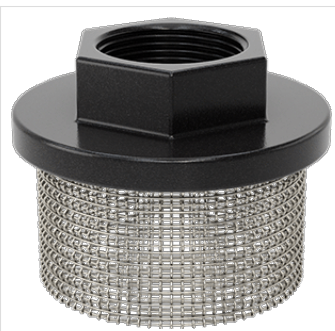
Suction Strainer for Pumps