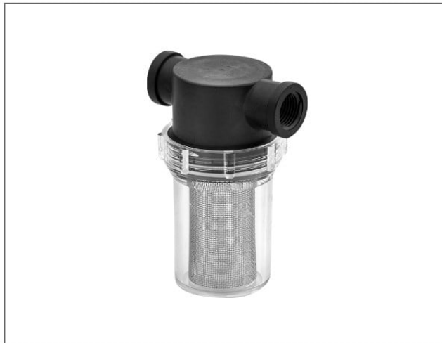
In Line Suction Strainer 1"