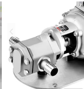
Stainless Steel 12GPM Oil Transfer Pump Head