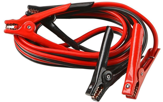
12V Cables with Alligator Clamps

Since 2009, we have been supplying portable and stationary pumps for moving all types of oil. Oil cleaning centrifuges are also important tools to re-use oil as fuel or lubricant.