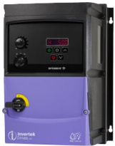
2HP VFD for Pump - Switched Outdoor