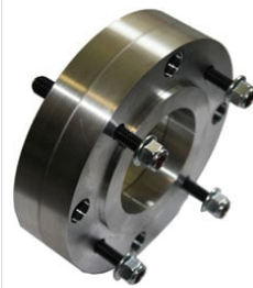
Gas Motor Plate Adapter

Since 2009, we have been supplying portable and stationary pumps for moving all types of oil. Oil cleaning centrifuges are also important tools to re-use oil as fuel or lubricant.