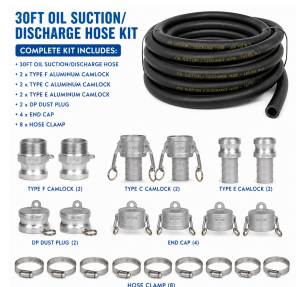
30ft Aluminum Camlock Hose Kit

Since 2009, we have been supplying portable and stationary pumps for moving all types of oil. Oil cleaning centrifuges are also important tools to re-use oil as fuel or lubricant.