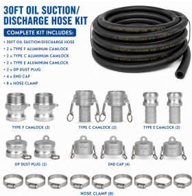
30ft Aluminum Camlock Hose Kit