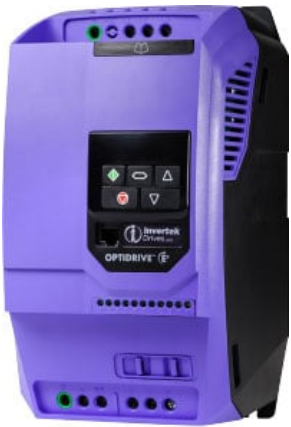
3HP VFD for 25GPM Pump Indoor