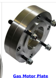
Gas Motor Plate Adapter