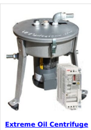
Extreme Oil Centrifuge