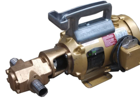
25GPM Portable Oil Transfer Pump - Massive Gears